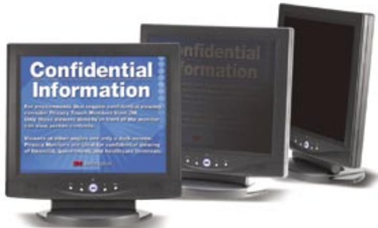
What onlookers see.