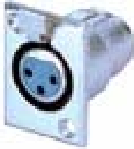
Model 5113A XLR (F) 3-pin rectangular flanged mount

Protect contacts and absorb vibrations in your audio applications