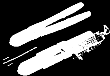
Micro Pneumatic Power System with Straight Action Hand Tool