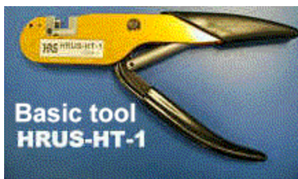
Hand tool body: HRUS-HT-1